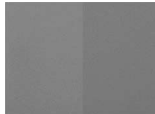
Unbalanced sensor with visible line